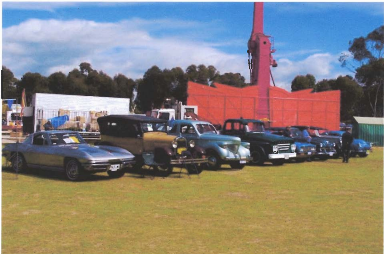
AVVVA Member's Vehicles at the 2010 Beverley Show