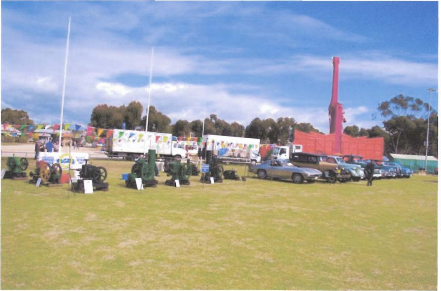
From 1993 Club Photos