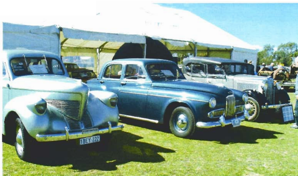
A collection of some of the cars displayed by members of the AVVVA at the Beverley Show, 18 th August, 2007