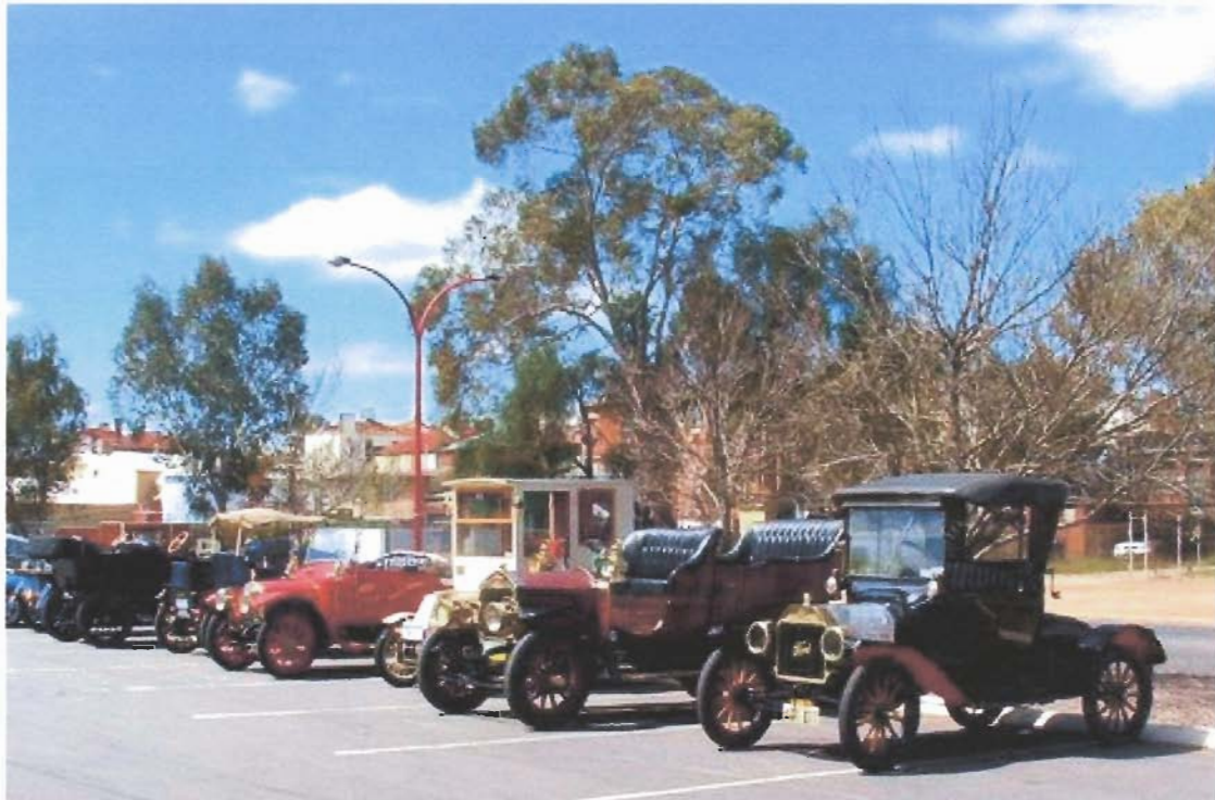
Veteran Car Club of WA members at Bernard Park , Northam Tuesday 6 th October