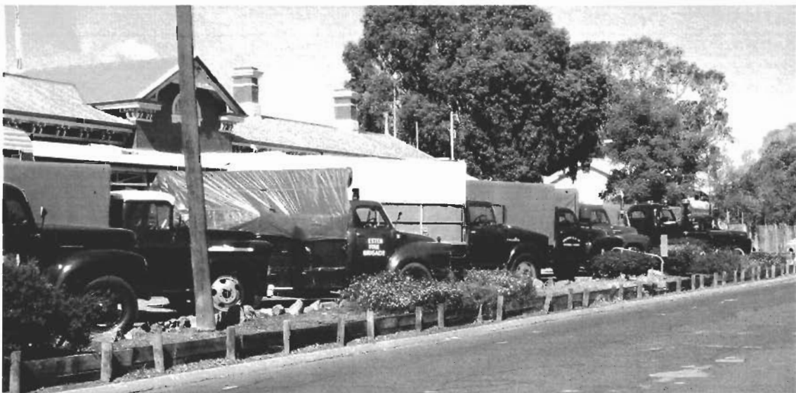
Trucks from the Warren-Blackwood Vintage Car Club Truck Trek 2007 when it passed through Northam on Tuesday 11 th September, 2007