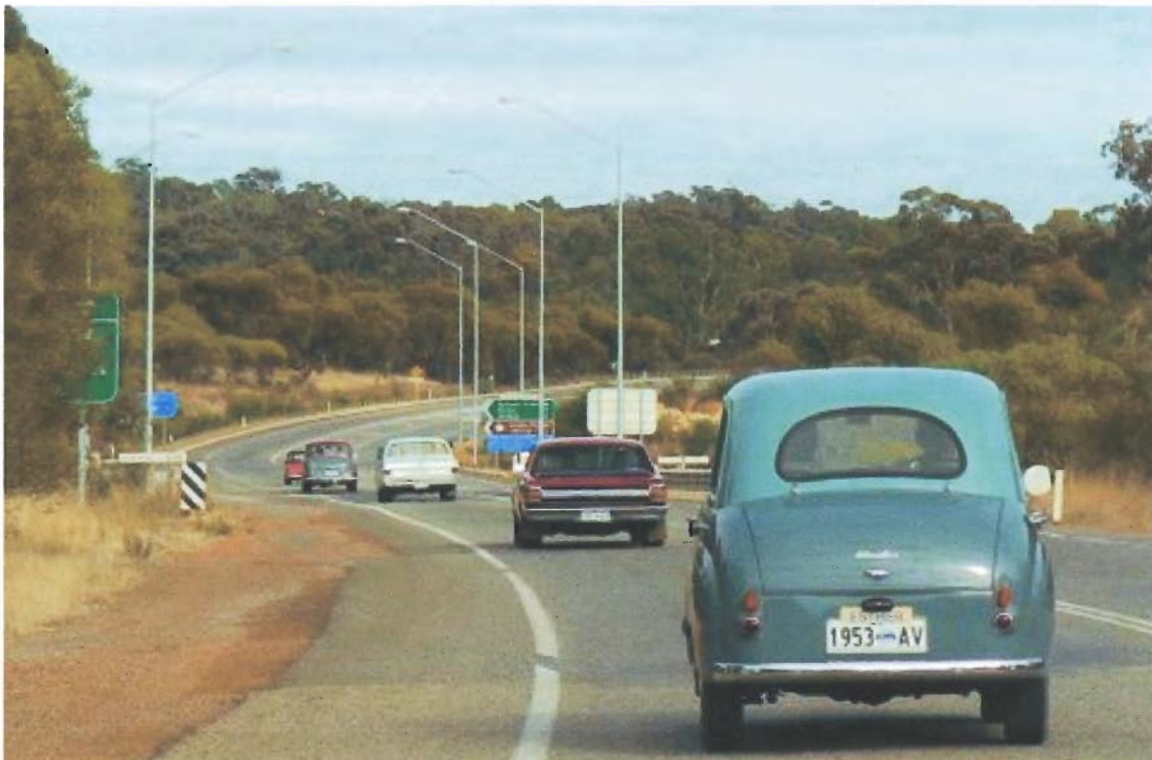
On the road to the Wundowie Iron Festival May 2010