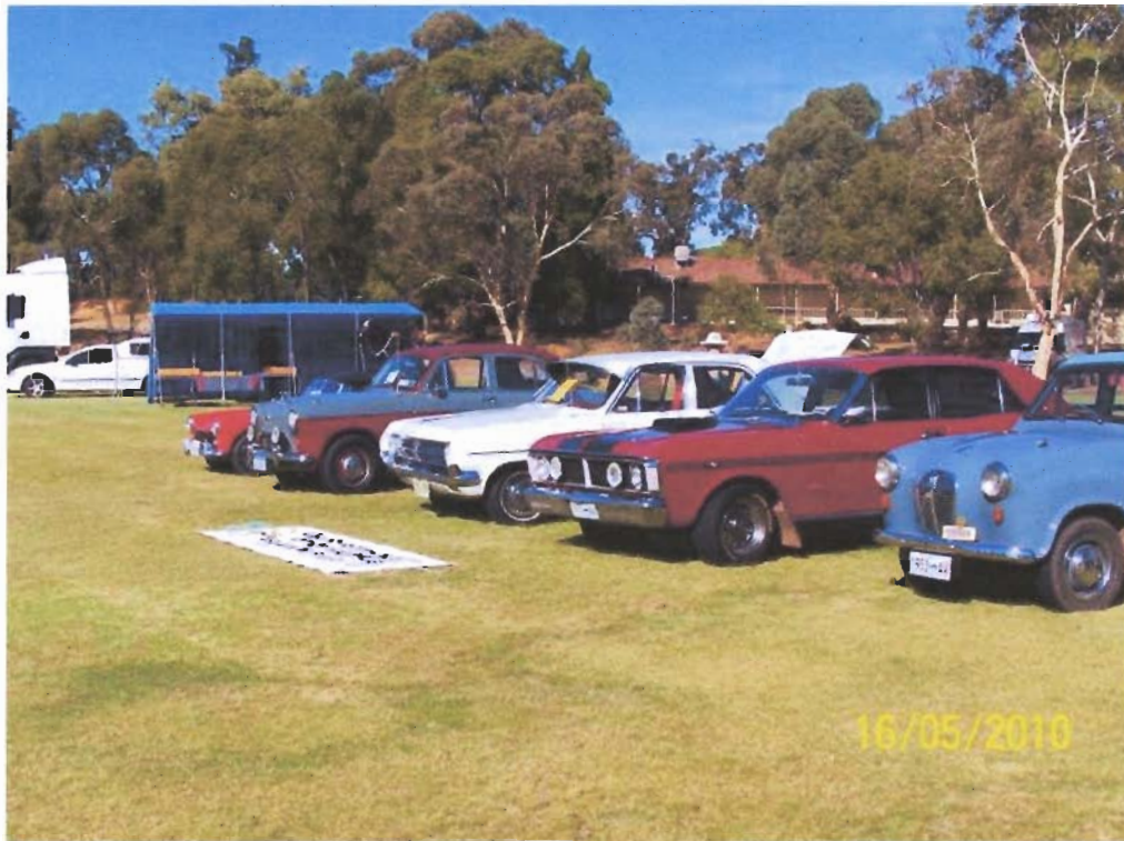
Cars at the Wundowie Iron Festival

Not received. ( Note AGM is 15 th July 2010 , following the July General Meeting ) .