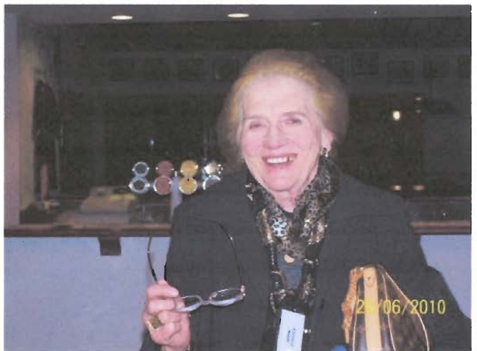
AVVVA 25 th Anniversary Dinner June 2010