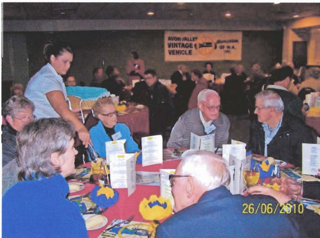
AVVVA 25 th Anniversary Dinner June 2010