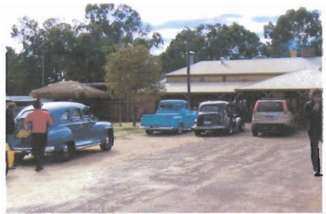
2010 Radio West Poker Run