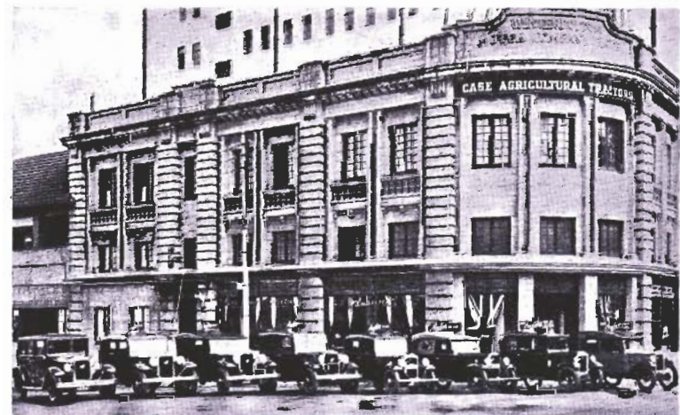
IN AUSTRALIA. A fine range of Austin models exhibited by the Winterbottom Motor Company, in the Empire Day procession at Perth, Western Australia.