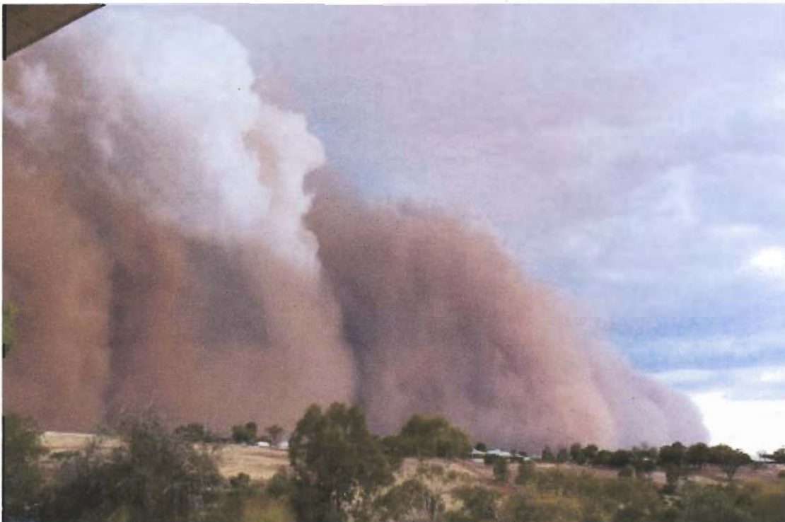
The violent dust storm approaching Northam Saturday 29 th Jan 2011 .

E-mail address: fsi93402@bigpond.net.au ABN 33 053 396 253