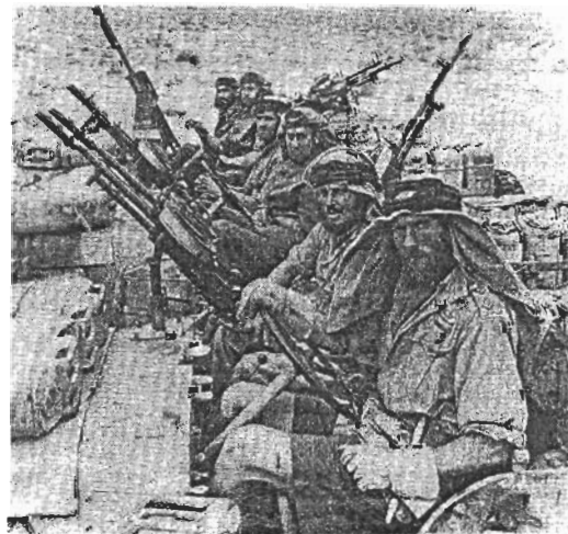
The Long Range Desert Group

They called themselves Herrenvolk, so they could enslave other countries and in the end the Allies won so that we, and our children, could live in a democratic and free country of our choice.