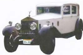
Repairer licence #MRB 2663

20 Oliver St Northam 6401 PH: (08) 9622 5851 MOB: 0421 890 586