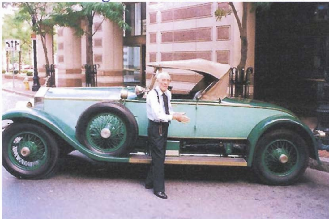
This Man Owned and Drove the Same Car for 82 Years