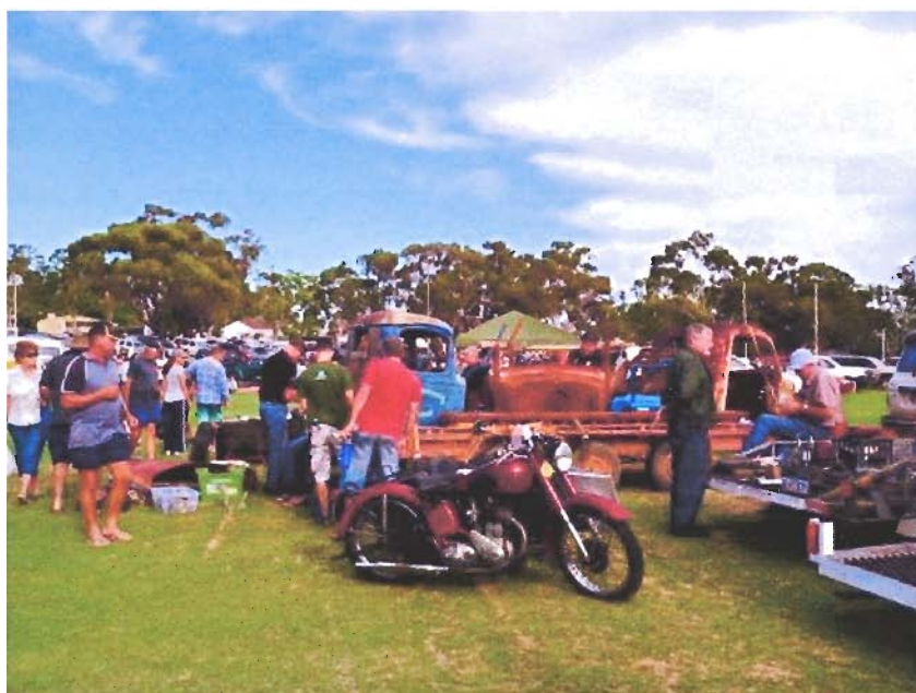
AVVVA 2012 Northam Vintage Swap Meet