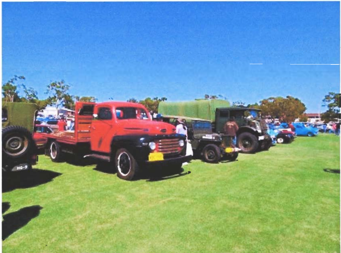
AVVVA 2012 Northam Vintage Swap Meet

E-mail address: fsi93402@bigpond.net.au ABN 33 053 396 253